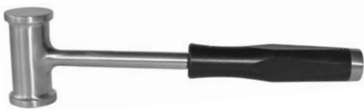
08.0506 Radial Head Hammer