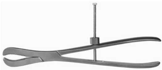
09.0185 Positioning Forceps