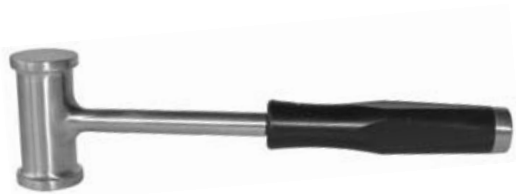
08.0506 Radial Hammer