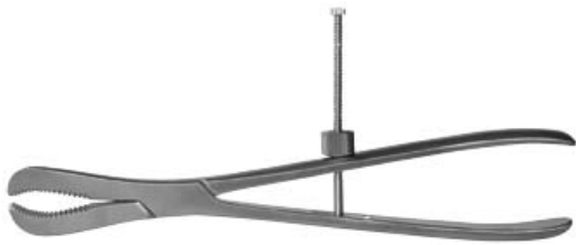
09.0185 Reposition Forceps