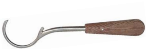
09.0110 Cable Passer