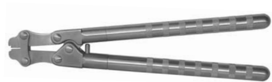
09.0108 Sleeve Crimper