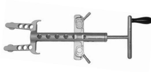
09.0107 Cable Tensioner